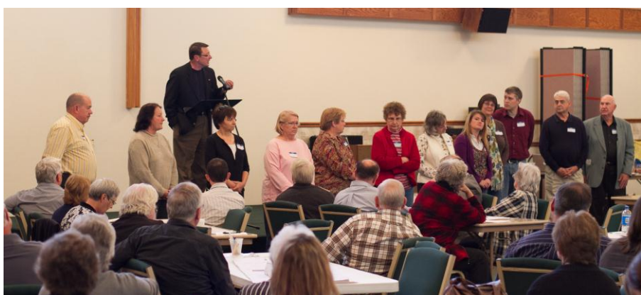
Blessing the new Operations Council